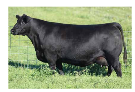
E A ROSE 918

Use this bull to sire a very distinct look backed by a tremendous cow family!