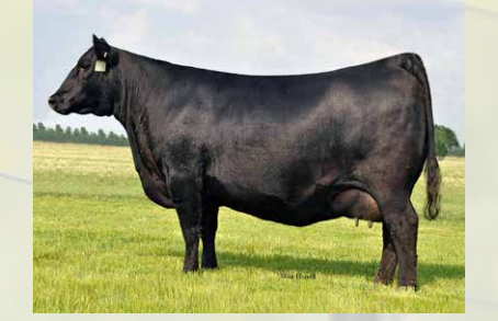
BUFORD ELBA 9000

Use Rito 634 to moderate mature size, add depth and width of body, improve udder quality, and improve feet.