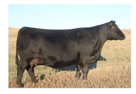
SAV EMBLYNETTE 2369

The first calves by Bloodline hit the ground in 2021 and look very promising. Be sure to take a long, hard look at this exciting young sire!