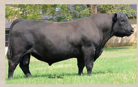
CHESTNUT REDEMPTION 38 - Sire of Lots 10A and 11.