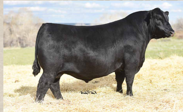
LT CONVERSE 8011 - Sire of Lot 22A.