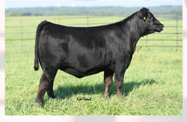
ZWT MADAME PRIDE 0556 - Lot 6A