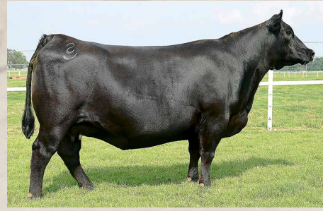
SITZ HENRIETTA PRIDE 643T - Grandam of Lot 5.