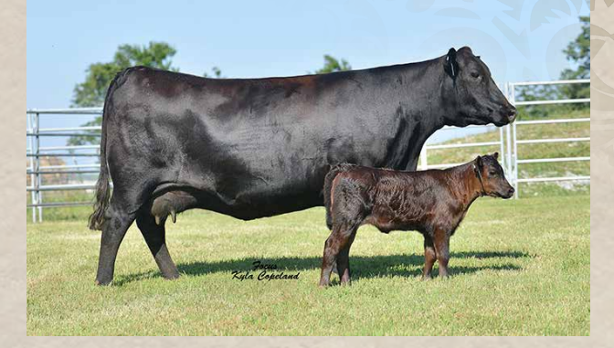
SIEBRING ELBA 234 - This ZWT foundation donor is a maternal sister to the grandam of Lot 9.