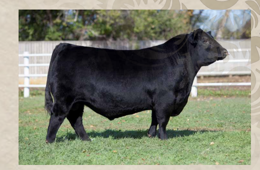
BROOKING GOLD COIN 8069 - Service sire of Lot 12.