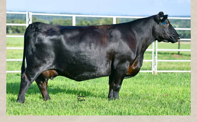
SIEBRING ELBA 247 – This ZWT foundation donor is a maternal sister to the dam of Lot 9.