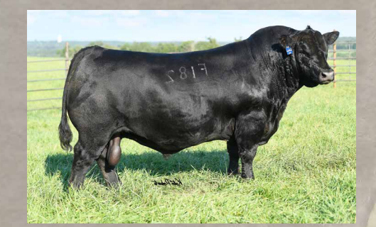
ZWT INFUSION F182 - Maternal brother to Lots 1A, 1B, 1C and to the dam of Lot 2.