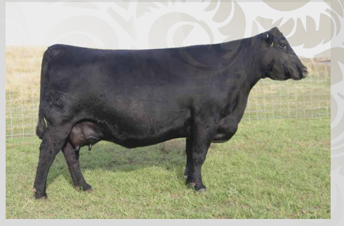
SAV MADAME PRIDE 0075 - Dam of Lot 6.