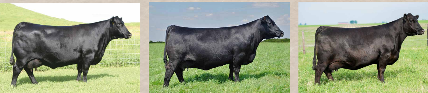
SAV ELBA 1094 - Third dam of Lot 9.