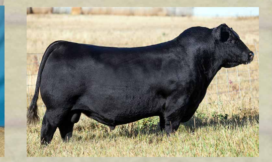
BROOKING BANK NOTE 4040 - Maternal brother to Lots 1A, 1B, 1C and to the dam of Lot 2.