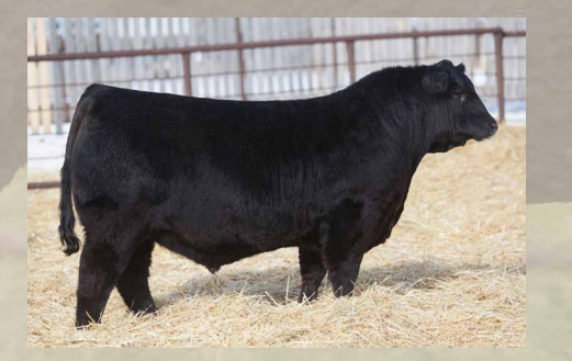
BROOKING MAJOR 7103 – Produced from a maternal sister to Lots 1A, 1B, 1C and from the dam of Lot 2.